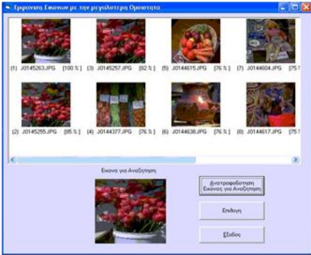
Figure 5: results of a color-based search