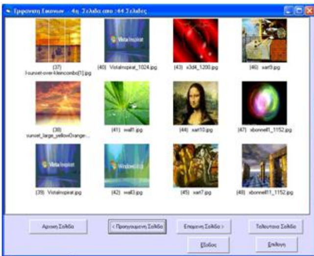
Figure 6: results of a browsing search