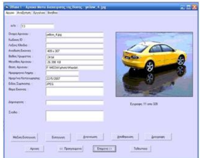
Figure 2: the initial administration screen

In Figure 2, the initial administration scheme of our system (a starting point for all the basic system functions) is depicted. From this screen, the user may choose a function, or browse the images in the database one-by-one (the first image of the database is initially shown). In Figure 3, the screen that permits text / properties-based search is depicted.