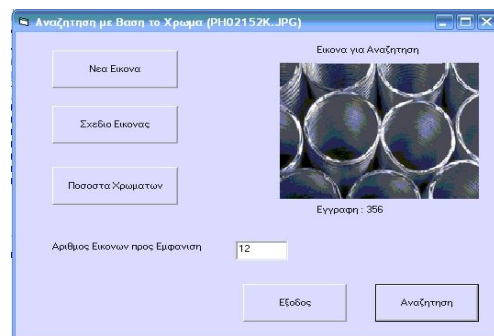
Figure 4: color-based search type choice

In Figure 4, the screen that permits the user to choose a color-based search type is depicted (by using the current database image, a new image, an image sketch created by himself, or by defining the distribution of the constituent colors). In Figure 5, the result of a color-based search is depicted. The user may choose any of the retrieved images and perform a new search based on it (relevance feedback). In Figure 6, the results of search by browsing (in group format) are depicted