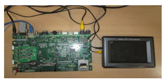
Figure - 4: Receiver Section

The receiver section has the TMS320DM6446 EVM as its core processor which is a dual-core processor with an ARM processor operating upto 300 MHz and a C64xx DSP operating upto 600 MHz. Similar to the transmitter section, the receiver section also has two parts, hardware part and the software part. The hardware part constitutes the core processor and the LCD monitor for display. The software section constitutes the MontaVista Linux LSP and Open Source Linux. We use TMS320DM6446 here as it can playback, communicate and record videos when compared with TMS320DM6443, which only has the operations of either playback or playback and communicate.