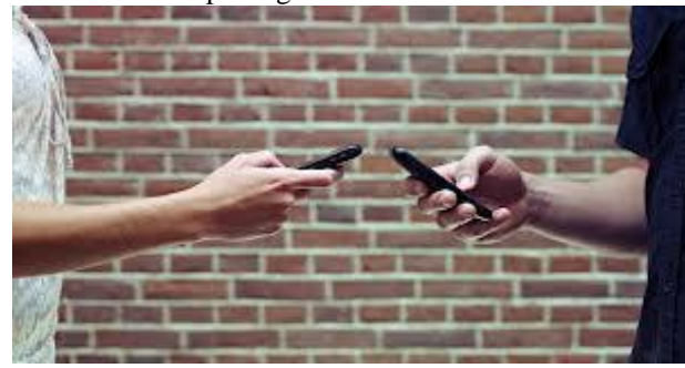
In this application the two devices communicating would belong to the same group of devices. An example could be a laptop and a digital camera. The user wants to establish a Bluetooth connection between the two devices to

exchange image data. The Bluetooth link is established by bringing the two devices close together and running a given protocol over NFC between the two devices. This makes it obvious for the user which two devices get actually linked and takes away the burden of navigating through menus and selecting the right devices from lists of possible communication partners. It should be noted that the NFC connection itself in this example is only used to establish the Bluetooth link. Image data is not transferred over NFC because NFC's bandwidth is simply too small for transferring big amounts of data.