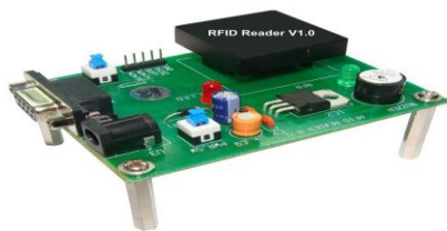
Fig. RFID Tag

A radio-frequency identification system uses tags , or labels attached to the objects to be identified. Two-way radio transmitter-receivers called interrogators or readers send a signal to the tag and read its response.