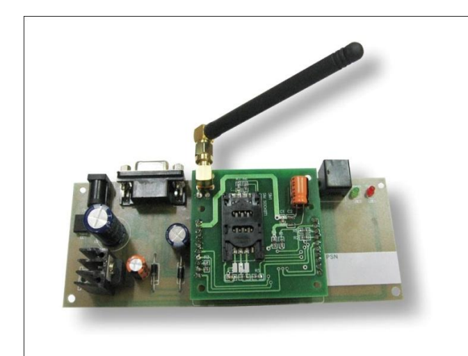
Figure 2. Sim-300 GSM Module

The SIM300 is integrated with the TCP/IP protocol. Extended TCP/IP AT commands are developed for customers to use the TCP/IP protocol easily, which is very useful for data transfer applications [7] [3].