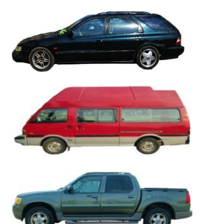
Figure 1. Samples input vehicle image