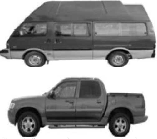
Figure 2. Samples of gray-level vehicle image

Histogram distribution of a gray-level image is normally used to determine suitable thresholding method. If the histogram distribution plot is bimodal shape, it means there is gap between foreground and background information then global thresholding can be applied. Otsu's method is an improvement on global method. The algorithm applied threshold value that minimizes intra-class variance and also able to maximize inter-class variance [10]. In case of uneven illumination of object, adaptive thresholding is required because a single threshold value may not be suitable for the whole image due to uneven distribution of intensity. Therefore such image needs to be partitioned into non-overlapping sub-images using different threshold values. In this work Otsu's method is used to convert gray-level vehicle images to binary images, samples of vehicle binary image obtained using Otsu's method are shown in figure 3.