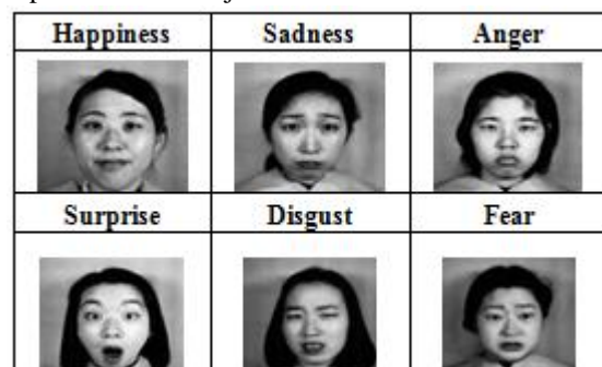
Fig. 1 Sample Images from JAFFE database

For our experimental studies: we have used JAFFE (Japanese Female Facial Expression) Database [9]. The database contains 213 images of six facial expressions (anger, disgust, fear, happy, sad and surprise) in addition to one neutral face posed by 10 Japanese female models. The size of each image is 256 \times 256 . For our experiment, we selected 210 images from the database; few of them are shown in fig. 1. There are 21 images come from one subject with 6 expressions with one neutral face, i.e. three images per expression of a subject.