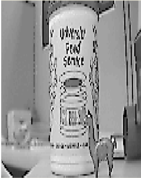
Fig 1. Input image of low resolution

On the other hand, if image height is changed to be half of the original size rotate the image by 90 degree before applying the algorithm and rotate it back after the retargeting. w can be user defined or just a constant. Since it may depend upon image content, w is automatically determined by structure complexity estimation. If the content structure is clear, it weights heavier on the compressibility rate and vice versa.