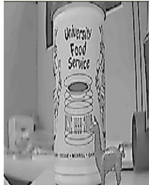
Fig 2. Output image of high resolution

system. To retarget a given image of size (W_0 \times H_0) to size (S_x W_0 \times S_y H_0) (This target size may not be equal to the exact target resolution (W_r \times H_r) ), the task is to recover the new coordinate (X_p, Y_p) of pixels p=(x,y) under three types of constraints. Take the calculation of X_p for instance. First, each pixel is supposed to be at a fixed distance from its left and right neighbors: X_{x,y} - X_{x-1,y} = 1 and X_{x+1,y} - X_{x,y} = 1 .