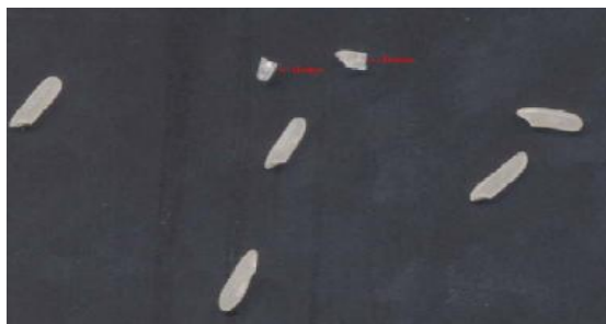
Fig.2.c.Broken Rice Image

Here A represent the original image of rice granules .B represent morphological image by applying minimum bounding rectangle method. C represent image of broken rice grains after classification basing on comparison of length [8].