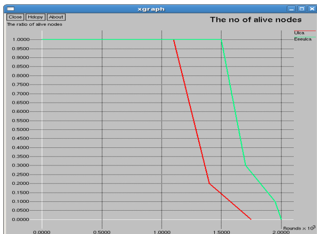
Fig. 3: The number of alive nodes over rounds

We can see that the span of time from the first node dies to the last node dies is greater in EEEULCA compared to ULCA. Thus EEEULCA clearly improves the network lifetime.