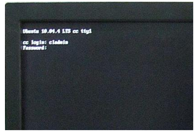
1. Log in to Cloud Controller

Client side access the cloud compliers from the node controller.