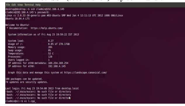
5.Write a c++ program in VI-EDITOR in client side