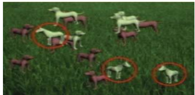
Fig. 3. ClickAnimal CaRP Scheme [1]

ClickAnimal is also a recognition-based CaRP scheme. It has an alphabet of similar animals such as dog, horse, pig, etc. The password in this scheme is a sequence of animal names such as \rho = "Cat, Dog, Horse, Turkey, \dots" . One or more models are built for every animal. The CAPTCHA generation process wherein 3D models are used to get 2D models by applying different views, colors, lightning effects, textures, and optionally distortions are used for generating the ClickAnimal image. The resulting 2D animals are then arranged on a cluttered background like grasslands. Some animals may be overlapped by other animals in the image, but their core parts are not overlapped in order for humans to identify each of them. The number of similar animals is much less than the number of available characters. ClickAnimal has a smaller alphabet, and thus a smaller password space, than ClickText [1].