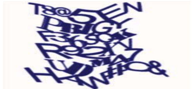
Fig. 2. ClickText CaRP Scheme [1]

ClickText is a recognition-based CaRP scheme. It uses text CAPTCHA as its underlying principle. Alphabet set of ClickText comprises alphanumeric characters. A ClickText password is a series of characters in the alphabet, e.g., \rho = "DE@F2SK78" , which is similar to a text password. A ClickText image is different from usual CAPTCHA as here all the characters of alphabet set are to be included in the image. The underlying CAPTCHA engine generates such CaRP image. When image is generated, each character’s location in the image is recorded which would be used in authentication. Characters can be arranged randomly on 2D space in these images which differs from text CAPTCHA challenges where characters are typically ordered from left to right in order for users to type them sequentially [1].