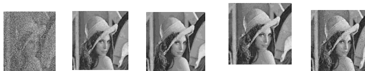
Figure 5. a) Noisy image with 70% Noise Density & PSNR of 6.99. Restrastion results obtained for b) 'X1' with PSNR of 24.46 c) 'X2' with PSNR of 25.69 d) 'X3' with PSNR of 23.29 e) 'X4' with PSNR of 22.47