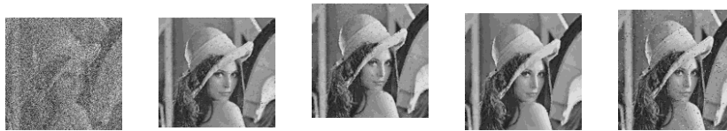
Figure 4. a) Noisy image with 80% Noise Density & PSNR of 5.98. Restrastion results obtained for b) 'X1' with PSNR of 28.47 c) 'X3' with PSNR of 28.5 d) X4 with PSNR of 27.32 e) X4 with PSNR 26.26