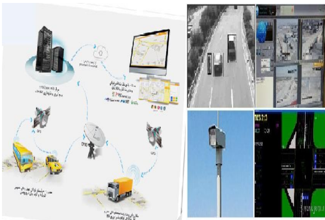
Fig. 1. The urban and inter city intelligent transportation systems

The most important functions and services offered by ITS include A:Managing accidents and rescue service, B:Giving information to drivers and passengers publically, C:Managing traffic and monitoring the vehicles on the road, D:Increasing the capacity of the lines. Intelligent transportation systems can be categorized into different levels according to the costs, execution time, and precision. First, the systems and tools in highways are briefly introduced and later for the purpose of modelling, they are categorized into four groups according to the mentioned criteria. Traffic lights, electronic signs, sensors, speedometers, and etc are the tools in intelligent transportation systems (see figure 1). In this paper, intelligent transportation systems were categorized into four levels by means of a questionnaire, and interviews with experts and scholars in the field of traffic and transportation engineering which are presented in table I. The levels of the system are accumulative meaning that each higher level includes the systems of the lower level. In other words, level two enjoys its own technologies as well as the ones in level one. Level three also includes level two and one. The fourth intelligent level includes all the modern intelligent technologies present in all four levels. The output variable of the decision support system in this research is the intelligent level.