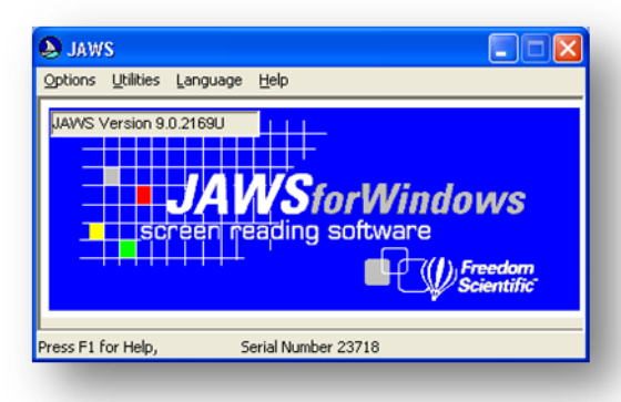
Figure 1 Screen reading software of freedom scientific company [4]

Freedom Scientific: The JAWS application, the screen reading software of Freedom Scientific Company who produces different products for the visually impaired, is a popular program that is widely used. JAWS is compatible with almost all Windows programs and is generally used in computers [4].