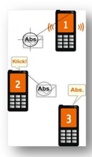
Figure 3 How text scout application works [5]

The photo captured by the camera is sent to a server, where the text is resolved and then read from the phone to the user.