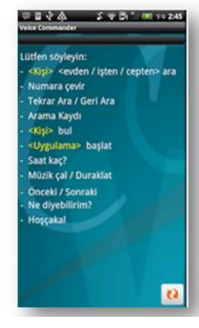
Figure 5 Voice-activated software of Cyberon [8]

The software can run on many operating systems such as Symbian, Android, Microsoft Windows Mobile, Windows CE and Linux.