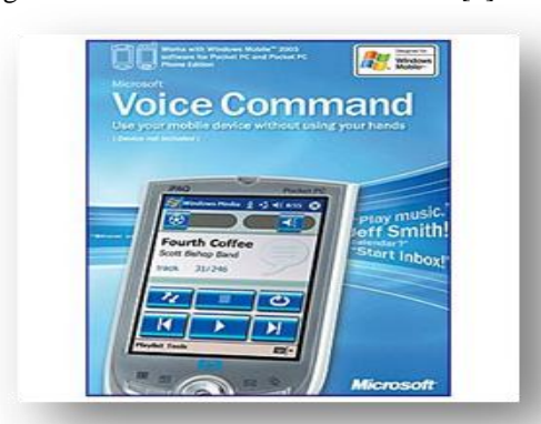
Figure 4 Voice-activated software of Microsoft [7]

Microsoft: Thanks to the Microsoft Voice Command application, which is available for mobile phones with Windows Mobile operating system and is free, allows users to manage their devices with voice commands [7].